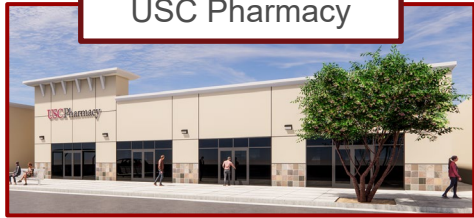
Rendering of new USC Pharmacy

3,500 square foot building subdivided into pharmacy, over the counter and clinical areas with 1 PIC, 1 clinical pharmacist, 2 technicians, 1 clerk at launch. Additional employees to include additional volunteer and clinical staff. The pharmacy will be staffed by community residents and include pharmacy students and other trainees.