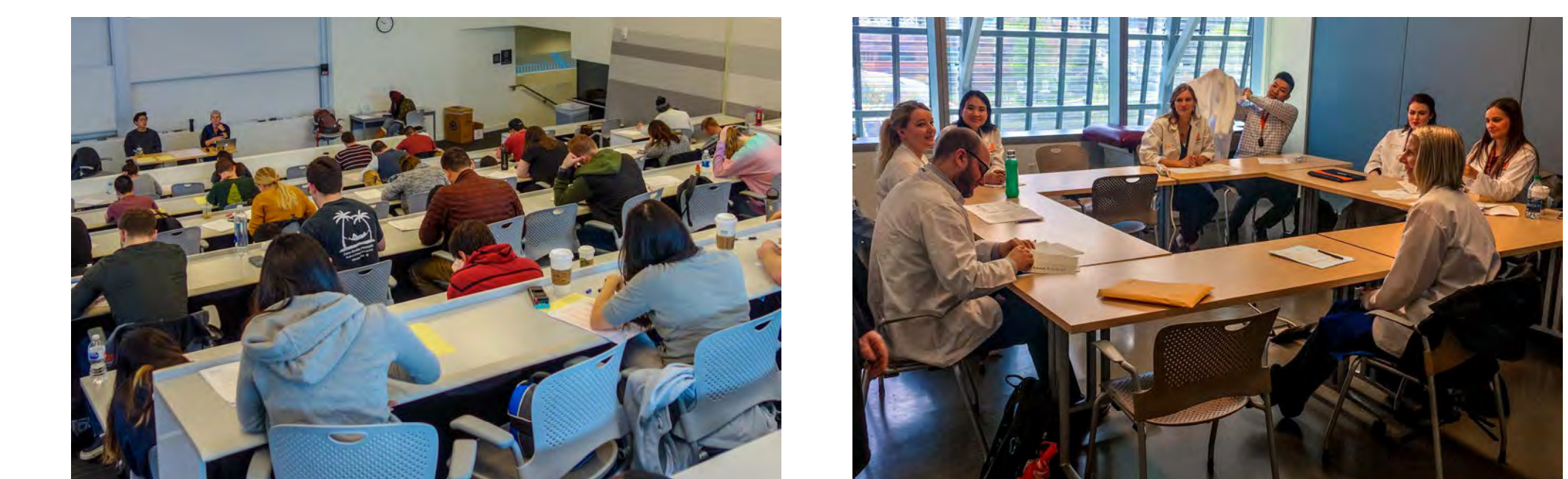
Left: Students complete one of the written exams. Right: Students engage in case-based small group discussions for complex case analysis.

"It is a way to assess your strengths and weaknesses. You already probably have a good idea of what those are, but the PAR Block helps give you more confidence in different areas."